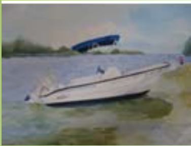
Boat